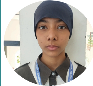
Reva X D